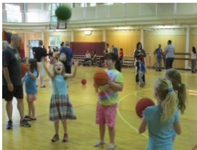
On the Court!