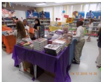
Picking out a good book