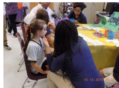
And face painting!