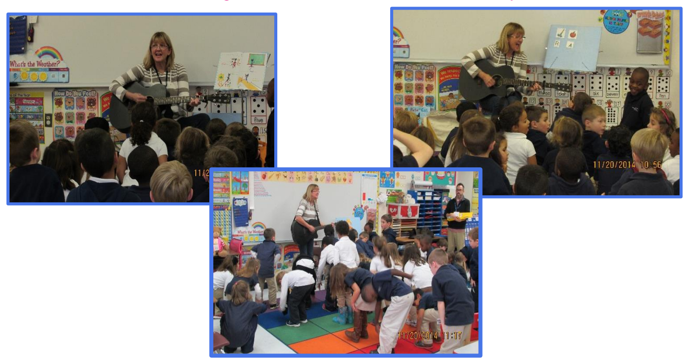
Holiday Fair for K-8<sup>th</sup> grade